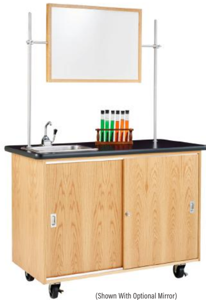
(Shown With Optional Mirror)